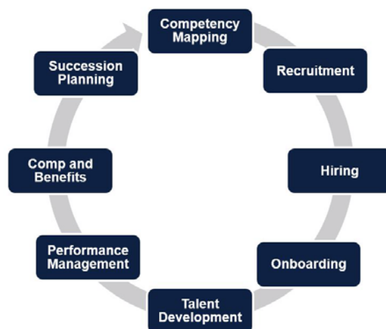
Fig.1 Network Structure System of Talent Education Management

Under the new situation, young teachers should infiltrate the scientific concept of talents, education and development into their daily teaching work, so as to fulfill their responsibilities of educating people and cultivate more outstanding talents for schools. Good teachers' ethics must be built on the basis of excellent ideological and moral character and correct teachers' professional ideals. Party organizations at all levels in colleges and universities should give full play to the leading role of politics, strengthen political theory study and professional ethics education, and strengthen young teachers' sense of responsibility, honor and mission. Young teachers should focus on the implementation of curriculum ideological and political education, actively explore the elements of curriculum ideological and political education on the premise of implementing the basic requirements of classroom teaching and scientific research, and make unremitting efforts to cultivate high-quality talents meeting the requirements of social development.